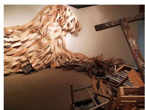
View of a former installation by Hollis Hammonds

Exploring consumerist culture through evidence of accumulation, hoarding and collecting, piles of rubble permeate the works of Hammonds. Growing up in semi-rural Kentucky, the youngest child of depression era parents, her surround ings were those of cold war stockpiling, nick-knack collections, and junk-yard recycling. After surviving a house fire in her teens, piles of burnt keepsakes created a lasting impression on her, of the impermanence and worthlessness of superficial possessions. Ranging from documentary studies of storms and storm damage, to elaborate drawings of trash heaps and landfills, to sculptural wall installations of crashing waves; her works often illustrate imaginary piles of debris left after fictional natural and man-made disasters. Post-apocalyptic in nature, her recent and past works deal with memory, material consumption, waste, catastrophe and superficial loss. Hammonds has been living and working in Austin, TX, since 2007. She received her MFA from the University of Cincinnati in 2001, and her BFA in drawing from Northern Kentucky University in 1998. Her work ranges in media from drawing to painting, to video and sculptural installations. Hammonds has exhibited her work throughout the US Page 14 - Carolina Arts, May 2014