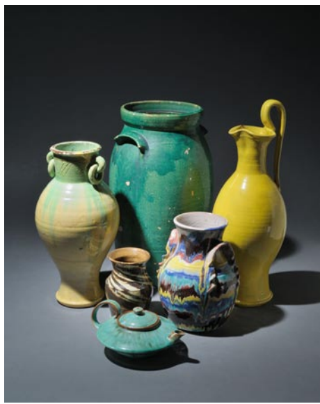
In the early 1900s, Tar Heel potters began using innovative colorful glazes and reinterpreted traditional shapes to transform their vessels into decorative items to sell.