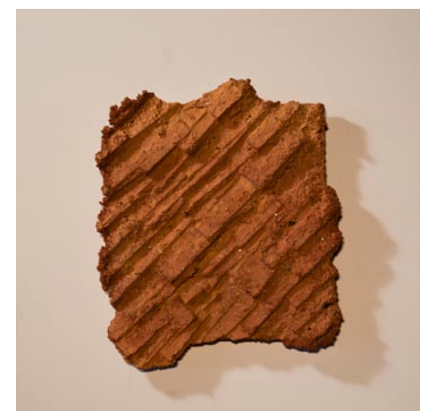
Work by Thomas Sayre

The earthcast wall pieces express a similar tension between the human tool and the texture, color, and resistance of the earth into which the castings are made. Related