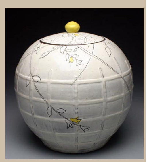
Work by Ben Carter

(http://www.carterpottery.blog-spot.com/2009/05/welcome-to-tales-of-red-clay-rambler.html).