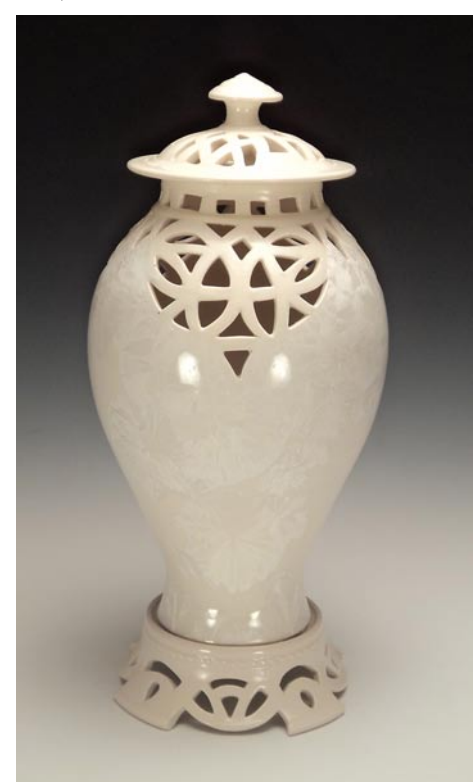
Work by Frank Neef

Coming up in June, Tom Gray Pottery has been invited for a second time to exhibit in Cedar Creek Gallery's National Teapot Show , June 6 through Sept. 7, 2014. The show features more than 200 teapots created by more than 160 American craftspeople. The gallery is in Creedmoor, NC. To learn more, visit (www.CedarCreekGallery.com). Tom Gray Pottery is located at 1480 Fork Creek Mill Road in Seagrove. For more information, visit (www.TomGrayPottery.com).