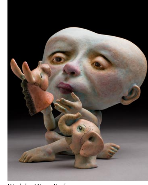
Work by Diana Farfan

Also showing at the Center for the Arts' Perimeter Gallery is TERRAFORM , featur- or visit (<u>www.yorkcountyarts.org</u>).