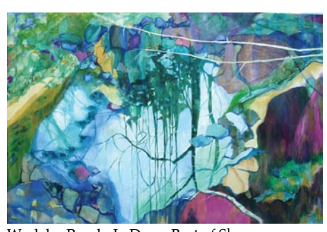
Work by Randy L. Dean, Best of Show

Hanzal says, "The theme of the garden is rich in associations, evoking a tamed and controlled environment, or a place where the unfolding cycles of nature – life, death and regeneration - may be observed. Thirty works of art were selected from the sixtythree submissions, including a variety of media -painting, sculpture, photography and drawing. It is inspiring to observe Page 36 - Carolina Arts, May 2014