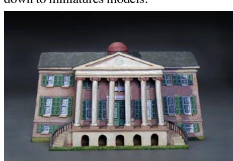
"Randolph Hall, College of Charleston by Lin Barnhardt

The exhibition will featuring Charleston architectural and historical landmarks meticulously hand built out of clay - scaled down to miniatures models.