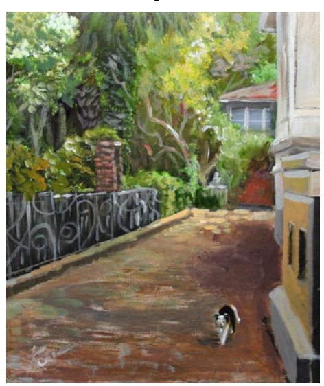
Work by Karen Burnette Garner

The Treasure Nest Art Gallery focuses on high quality, hand-painted oils and acrylics on canvas. The gallery represents over 100 artists from local, US regional and international locales. While it does not carry giclees or canvas transfers, it occasionally offers sculpture, watercolors, pastels and antique works as they become available.