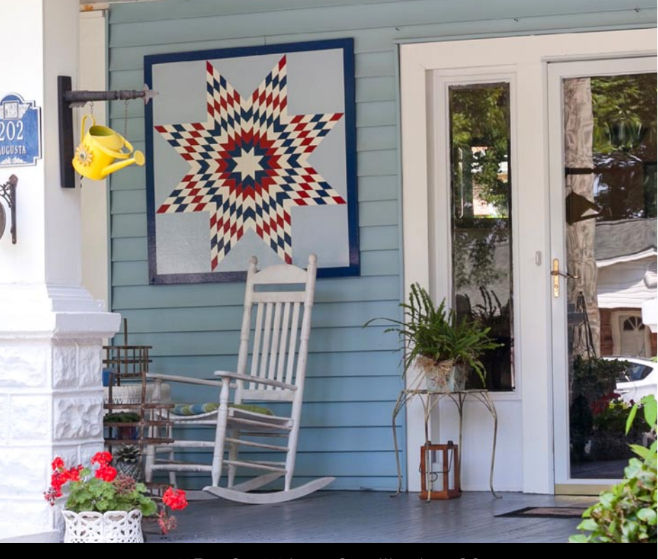
#98 Texas Star, 202 Augusta Street, Westminster, S.C.

The deadline each month to submit articles, photos and ads is the 24th of the month prior to the next issue. This will be May 24th for the June 2015 issue and June 24 for the July 2015 issue. After that, it's too late unless your exhibit runs into the next month. But don't wait for the last minute - send your info now. And where do you send that info? E-mail to (info@carolinaarts.com).