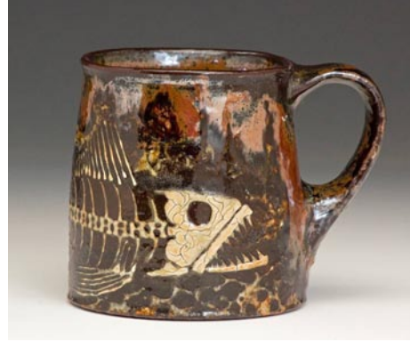
Work by Bruce Gholson

The North Carolina Pottery Center will open two new exhibitions May 30, 2015. "Prized Pieces: The Makers Collection" illustrates that makers tend to be collectors.