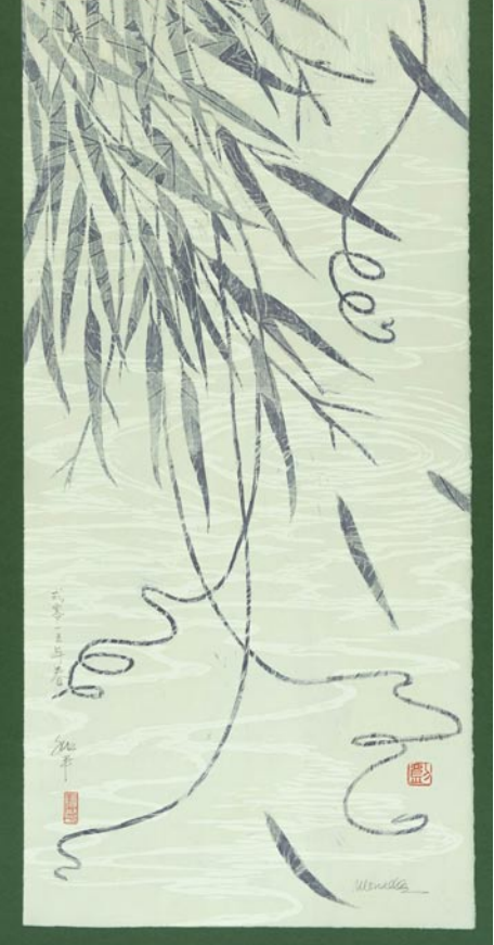
Work by Mona Wu

Myers continues to explore the emotion inherent in landscape, particularly when it