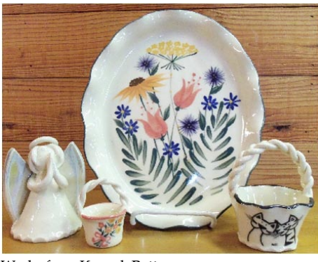
Works from Kovack Pottery

Kovack Pottery's spring event is May 23 – 31, 2015. The event will feature a large selection of hand-built, hand-turned, hand-painted, numbered, limited edition pieces. Each piece comes with a certificate of authenticity signed by both the potter and the artist who created it. The shop is open Mon.-Sat., 9am to 5pm and Sun., noon-5-pm.