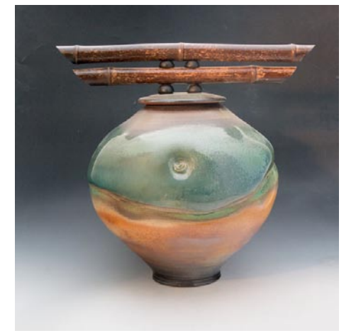
Work from Dalton Pottery

In 2003 the Daltons moved to their current location, where they built a studio before building their home. Jim says they had their priorities in place!