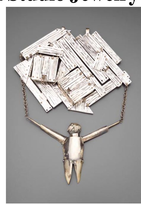
La Boheme Pendant, about 1995–2000, Laurie J. Hall, American, born in 1944, silver, aluminum, 8\,1/4\times6\,1/2\times3/4 inches. Museum of Fine Arts, Boston, The Daphne Farago Collection 2006.230

The works, like the artists, are varied and have been selected to reflect a broad range of ideas, with nuances that show the possibilities of the practice. They are united by the vision of the collector. Featured art-