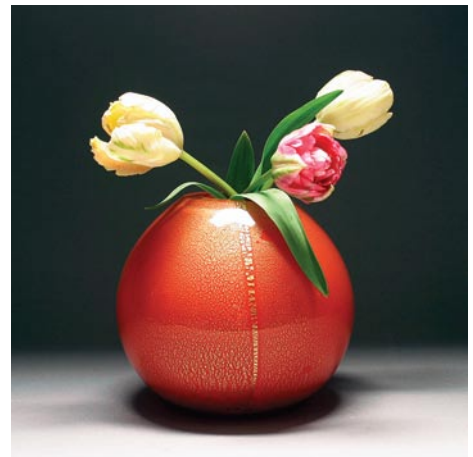
Work by Scott Summerfield

Arranged geographically, the work is displayed to make it easy to navigate from studio to studio in this two-county event, now in its 22nd year. With guide and pencil in hand, visitors can choose their route for the tour weekend or purchase a piece of art they just can't wait to have.