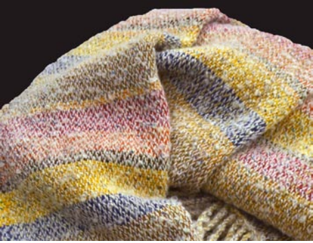
"Nature's Rainbow," detail c. 2000 by Edwina Bringle. Natural dyes: indigo, onion skin, plant matter.