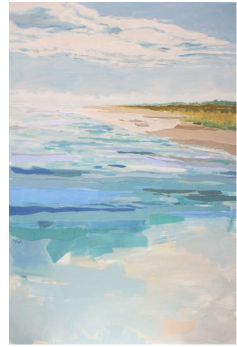
Work by Karin Olah

Continuing the series of works "that contemplate the seam where ocean meets sky," Olah explores the "metaphorical connections between fabric and subject Page 12 - Carolina Arts, May 2016