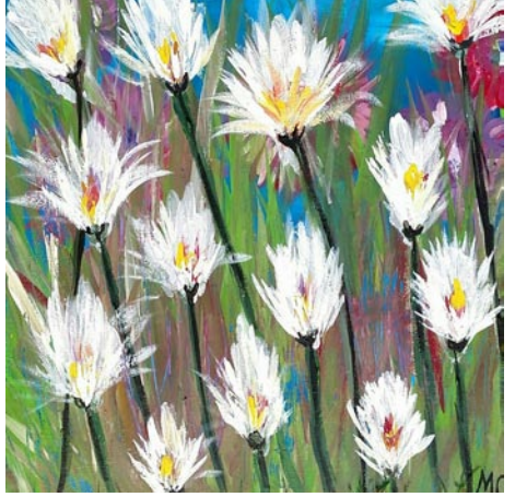
Work from a little art studio

Throughout downtown Lancaster, May 20, from 6-10pm & May 21, from 10am-10pm -"Seventh Annual Red Rose Festival". Look for this award-winning event to deliver another great weekend of live music, arts and crafts, children's games and rides, dog show, car show, and (best of all) free admission. This year's music line-up offers something for every taste - from Southern Rock and Beach Music to Soul and the Best of the '90's. Those who love original works of art will find artists and craftsmen lining the downtown streets, offering a myriad of works handcrafted in the Carolinas. At the Historic Springs House, visitors will find the "Red Rose Photography Exhibit", an annual contest hosted by Lancaster County Council of the Arts. Make plans now to come to See Lancaster, SC, with your friends and family to start your summer season with downtown festivities and fun. For more information, visit (<u>www.lancastercitysc.com</u>), e-mail to (events@lancastercitysc.com), or call 803/289-1145.