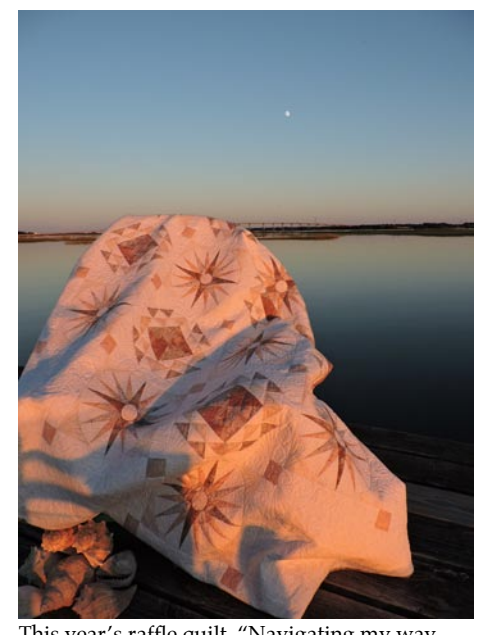
This year's raffle quilt, "Navigating my way

Before the compass rose was used on navigational maps, directional lines were drawn from central points but they became hard to follow because so many lines ended up intersecting each other. The rose design, so named because the points resembled the flower, made it easier to follow directional lines, which made navigation over the open seas easier to accomplish year 'round, regardless of weather conditions. A full compass rose has 32 points, indicating the direction of