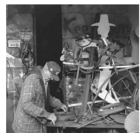
Work by Ron Sowers

Ronald Sowers is an exceptional black and white photographer with a thirty-five