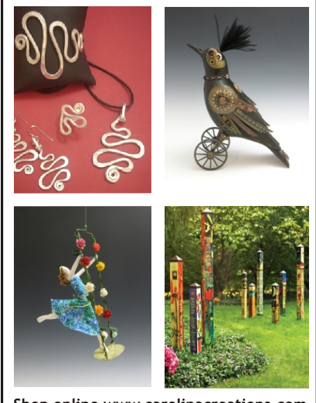
Shop online www.carolinacreations.com