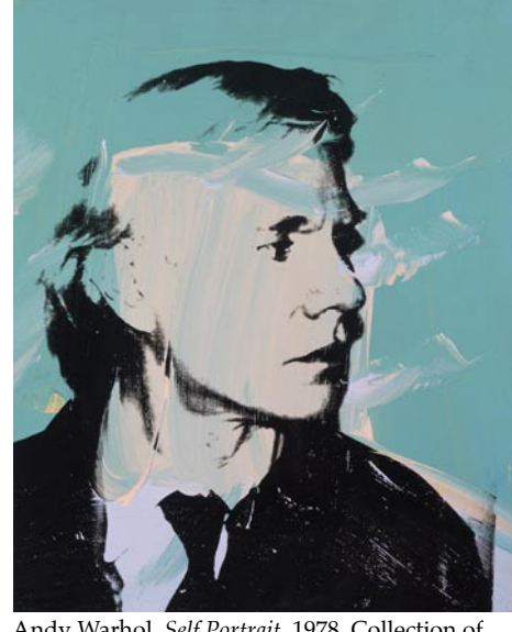
Andy Warhol, Self Portrait, 1978. Collection of The Andy Warhol Museum. Copyright 2012 The Andy Warhol Foundation/Artists Rights Society (ARS), New York

Andy Warhol: Portraits includes more than 130 portraits produced by Warhol from the 1940s to the 1980s. This exhibition contains portraits of Warhol in his youth, a reproduction of Warhol's first celebrity autograph (from Shirley Temple in 1941), early portrait drawings from the 1940s, samples of Warhol's commercial work from the 1950s, movie star portraits Page 10 - Carolina Arts, June 2012