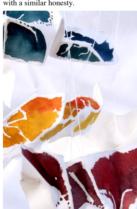
by how to each other we hold, detail by sarah goetz

to leave your unconditional love out continued above on next column to the right | for a stranger to find, a body of paintings