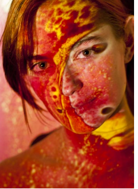
The face is a still from the 16mm film projector performance "the audience's present"

which investigates what emerges as the result of a deep meditation on the truth of a state of being - be it an artistic adventure, a philosophical exploration, or a life experience. Each brush stroke is a decision of one moment - accepting the past, engaging fully in the present, and shaping the future - all in an attempt to connect a single part to a larger whole. The intense honesty involved in this process results in work that functions as an open offer of connection to anyone who approaches it with a similar honesty.