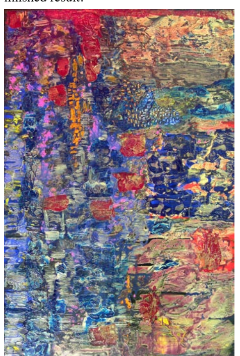
Work by Eduardo Lapetina

separate processes. A potter will form a shape, let it dry, fire it, come back later to glaze it, and then fire it again," Childs explains. "I think this often results in disunity. The technique I've developed is to glaze the pots as soon as they have stiffened up a bit (leather hard) and then carve through the glazes into the clay. This is an attempt to bring form and surface together as one element both in my mind and in the finished result."