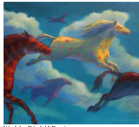
Work by Ráed Al-Rawi

The exhibition includes artists working in a variety of media: