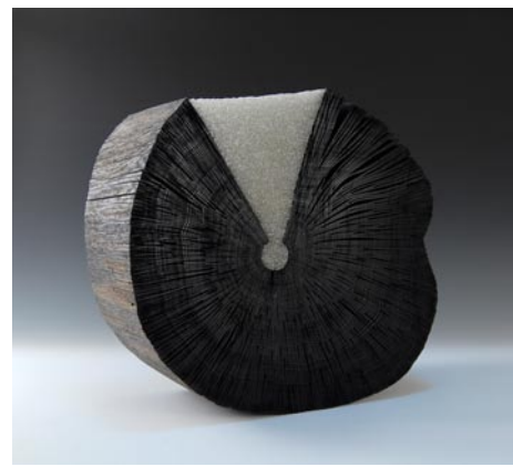
Mike Krupiarz, "Measured In Time", Ebonized red oak, pulled glass threads.

While the production of glass objects in Appalachia dates as far back as the 1700s, it was only within the past few decades that artists began exploring and defining the creative potential of glass as a sculptural medium. American ceramicist and educator Harvey K. Littleton was teaching at the University of Wisconsin when he began experimenting with glass in the 1950s. Many artists at the time were looking for ways to