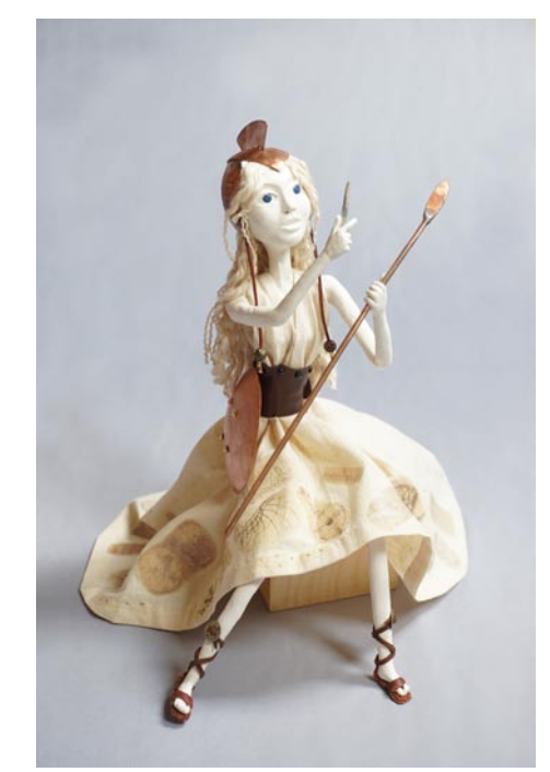
Work by Lynn Wartski

Wartski reflects, "This entire year I've been experimenting with other surprises that allow some dolls to tell even more of their story. While continuing to refine gesture and expression, I've also incorporated text and