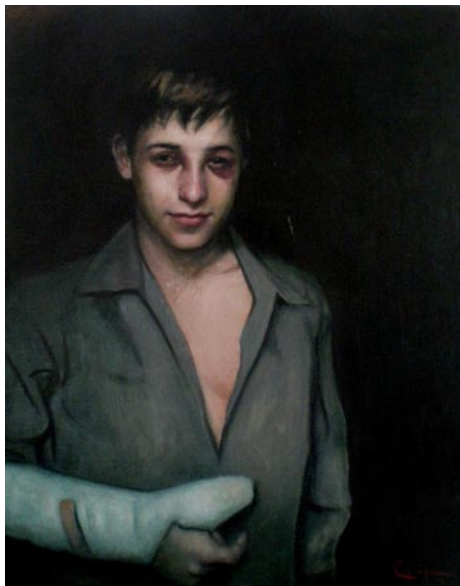
Work by Osiris Rain

Rain's work can be found in both private