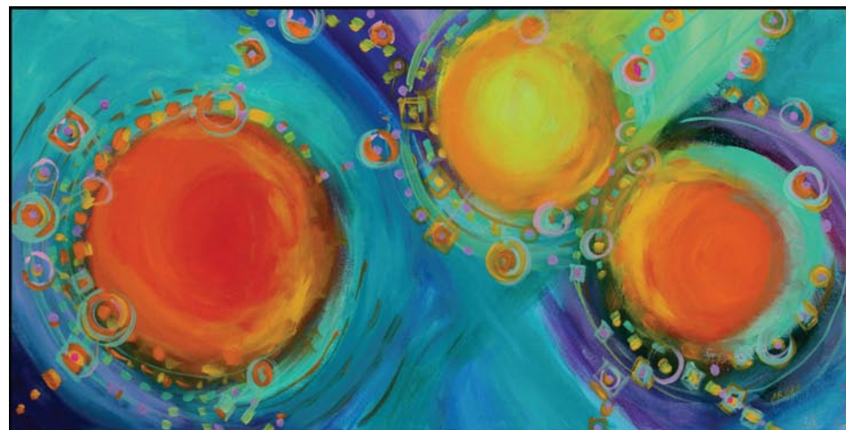
Astral Convergence • acrylic on canvas • 24" x 48"