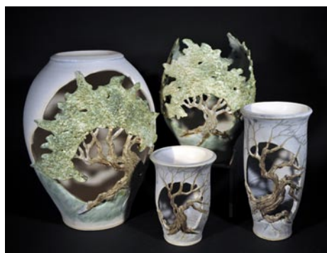
Works from Walton's Pottery

Pottery Road Studio and Gallery, home to Walton's Pottery, will hold an "All that Glows" event July 5, 2014, 10am to 5pm. Don Walton's work will be in the spotlight for this event. Featured work will include Walton's intricately carved tree pot luminaries, and unique lamps and lighting pieces. Pottery Road Studio is located at 1387 NC Hwy. 705 South in Seagrove. More information can be found at ( www.PotteryRoad.com ).