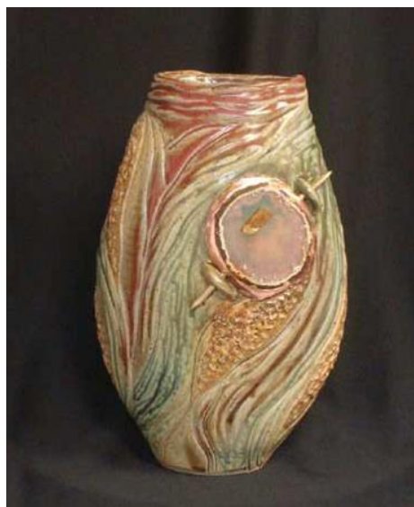
Work from Caldwell-Hohl Artworks

Caldwell-Hohl Artworks annual Garden Party will be July 19, 2014. The event will celebrate the beauty of the garden with garden art, birdhouses, toad huts and totems. Caldwell-Hohl is located at 155 Cabin Trail in Seagrove. For more information, visit ( www.CaldwellHohl.com ).