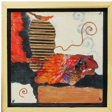
Work by Jill Hope

For further information check our NC Commercial Gallery listings, call the gallery at 910/575-5999 or visit ( www.sunsetrivermarketplace.com ). The