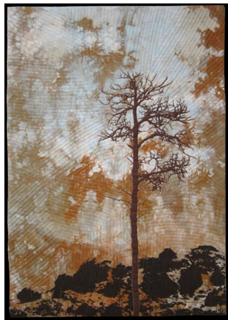
Work by Do Palma

Our policy at Carolina Arts is to present a press release about an exhibit only once and then go on, but many major exhibits are on view for months. This is our effort to remind you of some of them.