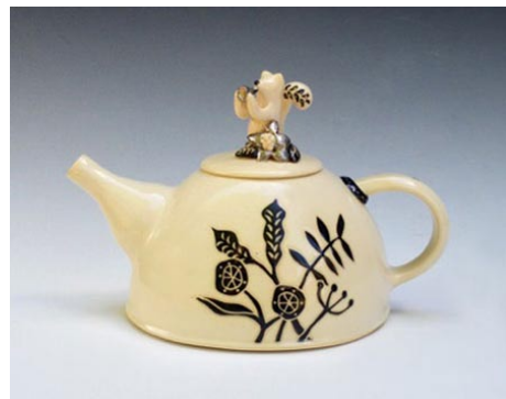
Work by Reiko Miyagi

Mississippi Department of Archives and History in 1992 (with Welty selecting the images and printing techniques) to represent the range of her photographs from the 1930s and early 1940s. For further information call the Museum at 919/839-6262 or visit ( www.ncartmuseum.org ).