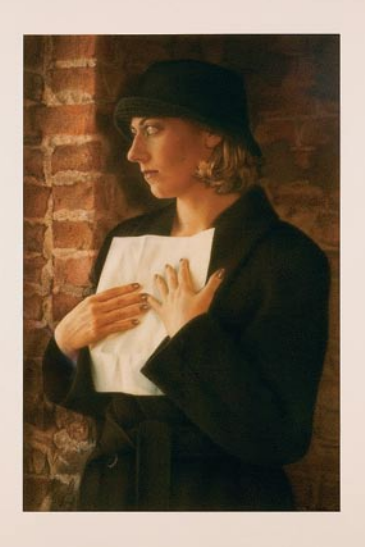
Best of Show 2010