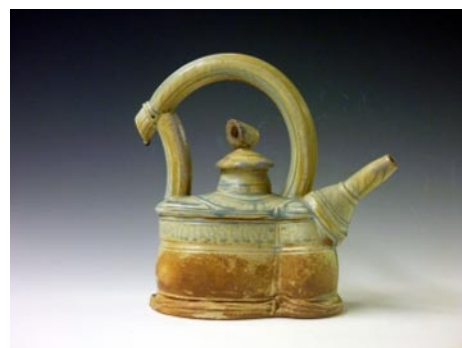
Work by Sue Grier

membership stands at more than 900 artisans selected by a jury for the high quality of design and craftsmanship reflected in their work. Craft practice has evolved to encompass forms that include functional, decorative and sculptural objects.