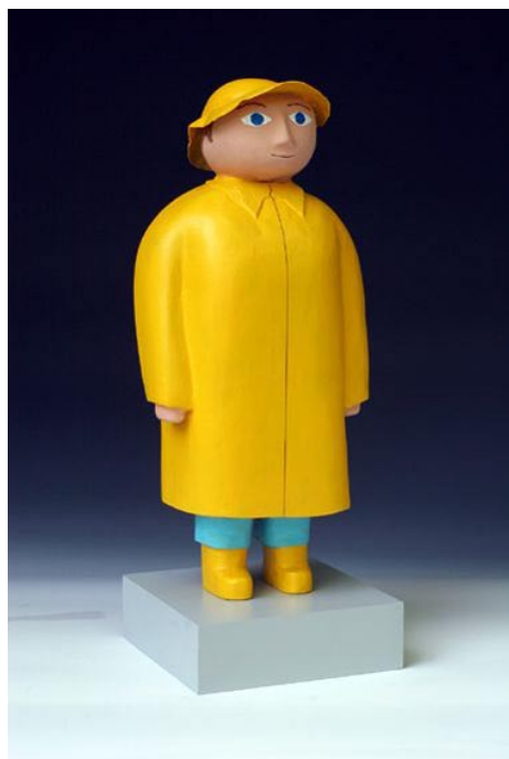
Work by Jim Kransberger

The Folk Art Center of the Southern Highland Craft Guild, located on the Blue Ridge Parkway in Asheville, NC, is presenting the exhibit, Raising Standards: New Members of the Southern Highland Craft Guild , on view in the Center's Main Gallery through Sept. 18, 2011.