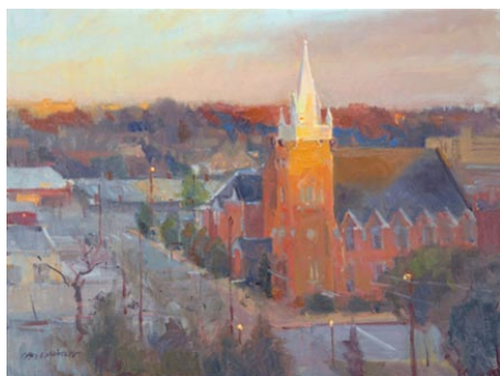
Work by Dawn Whitelaw

Nicole's Studio & Art Gallery in Raleigh NC specializes in local to nationally recognized artists with a focus on Contemporary