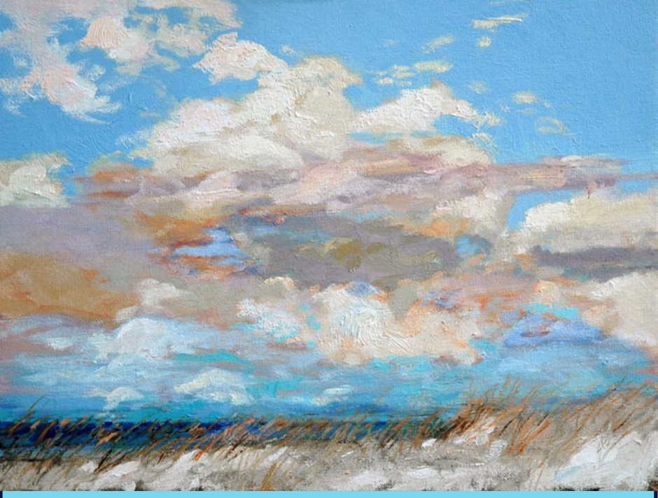
Morning Sky Over Lake Michigan

"I love doing any type of photography continued on Page 39