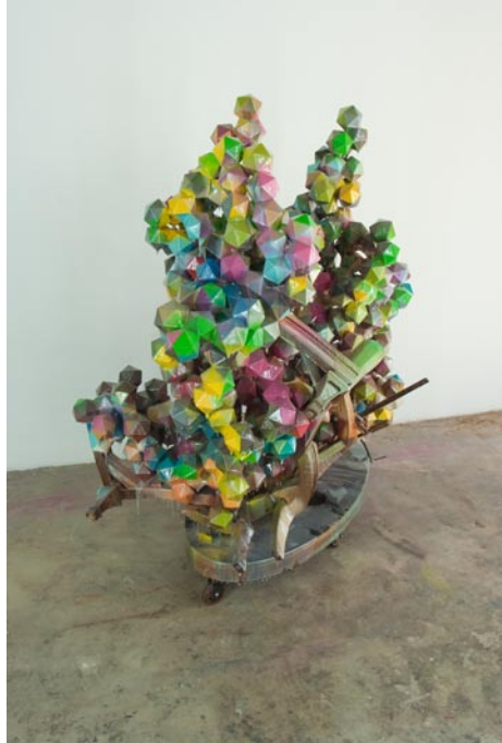
Work by Sinisa Kukec

Redux Contemporary Art Center in Charleston, SC, will present the exhibit, FROM VOID TO VOID , a solo exhibition by Sinisa Kukec on view from Aug. 10 through Sept. 20, 2012. A reception will be held on Aug. 10, from 6-7pm.