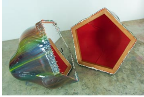
Work by Sinisa Kukec

Through the use of amorphous sculptures, epoxy, neon, mirrors, and all things shiny or broken, Kukec's dry wit challenges