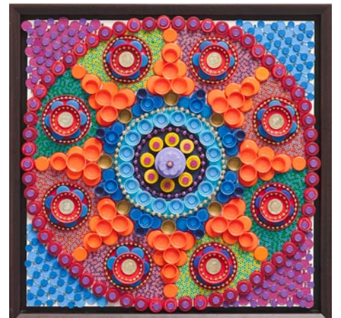
Work by Kirkland Smith

The 3-Dimensional items have been assembled into large representational "paintings" including portraits of Marilyn Monroe and Bob Marley. Viewed at close range, the images are unrecognizable but the individual items are not. Viewers will identify items that consumers discard daily: plastic bottle caps, make-up containers, cell phones, and fast food toys. From a distance, the Assemblages come into focus to reveal representational images- primarily portraits.