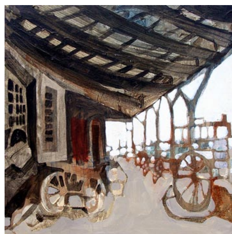
Work by Robert Irwin

Publishing Company, SAS Institute and Paul Stookie of Peter Paul & Mary.