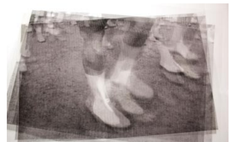
"Timekeeper," silk organza and light box, by Kate Nartker

memories and images of the past. It is a manipulation of history, and a distillation of our emotional responses to a wide continued on Page 7