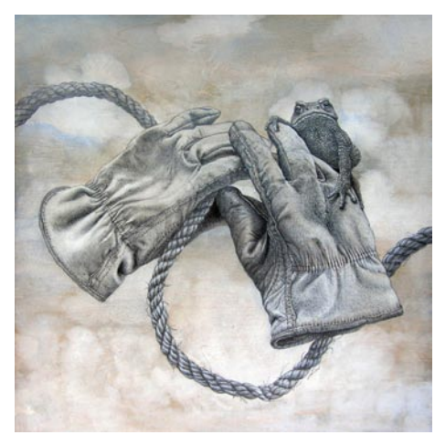
Work by Jean LeCluyse

Alan Dehmer's work is a hybrid of photography and printmaking. The gum bichromate print process he uses transforms his photographs into something new and decidedly different from the original camera image. It bears the mark of that first photographic moment, but it also achieves