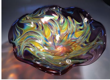
Work by Pringle Teetor

Graebner is a night person. She says, half-jokingly, that the only time she sees the dawn is just before she goes to bed. "My biological clock has always tilted in that direction and my creativity doesn't usually flow until after 6pm. It's not surprising, therefore, that I've painted dozens of sunsets and night-themed paintings." This show features a number of both. Under the Moonlight, painted on panel, is of the ocean in moonlight. "Last winter my husband and I spent a week in a high-rise on the beach. The moon was full and watching the play of the light on the waves, simply magical. I used mop brushes and many thin layers of paint to capture my sense of that light."