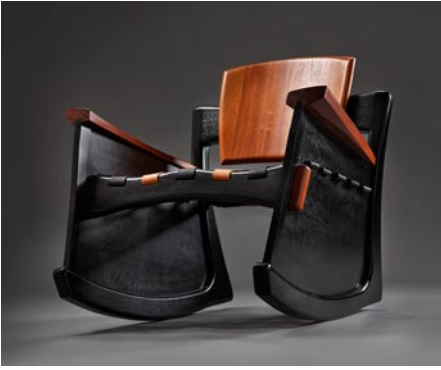
Work by Mark Whitley Grovewood Gallery in Asheville, NC, will present Grovewood Rocks! , a show-

The deadline each month to submit articles, photos and ads is the 24th of the month prior to the next issue. This will be Aug. 24th for the September 2016 issue and Sept. 24 for the October 2016 issue. After that, it's too late unless your exhibit runs into the next month. But don't wait for the last minute - send your info now. And where do you send that info? E-mail to (info@carolinaarts.com).