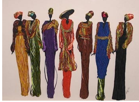
Work by Addell Saunders

The Charleston County Public Library in Charleston, SC, will present the exhibit Images of South America: Sailing With Art - An Inter-American Artistic Dialogue Exhibit, on view in the library's lobby, from Sept. 6 through Oct. 6, 2012. A reception will be held on Sept. 6, from 6-8pm.