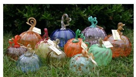
Glass pumpkins from STARworks Glass Lab

Hand-blown glass pumpkins will be ripe for the picking at STARworks Pumpkin Patch on Oct. 6, from 9am to 1pm. Over 1000 glass pumpkins in all shapes, sizes and colors made by the artists at STARworks Glass Lab will be available. This is the only time of year the pumpkins can be purchased. For more information, visit (www. starworksnc.org) or call 910/428-9001.