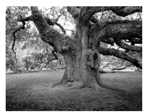
Work by Paul Shatz

The highlight of the week again is the outdoor Street Fest, Saturday, Oct. 19 -Sunday, Oct. 20, which features the juried Artist Showcase and Market on Calhoun Street with over 100 artists from 10 different states. These artists will be displaying their fine art; local restaurants and caterers will be serving up delicious seafood dish-