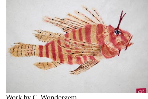
Work by C. Wondergem

The traditional opening ceremony, the Blessing of the Fleet and Boat Parade on the May River, will again kick off this week of festivities at 4pm on Sunday, Oct. 13, preceded by a Showcase of Local Art, an outdoor art exhibit from 11am – 4pm in the heart of Old Town Bluffton, and finishing the day with the first Oyster Roast