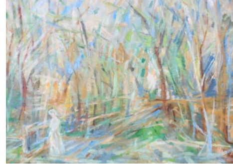
Work by Olga Michelson lery at 828/251-5796 or visit (www.ashevillegallery-of-art.com).

For further information check our NC Commercial Gallery listings, call the gal-