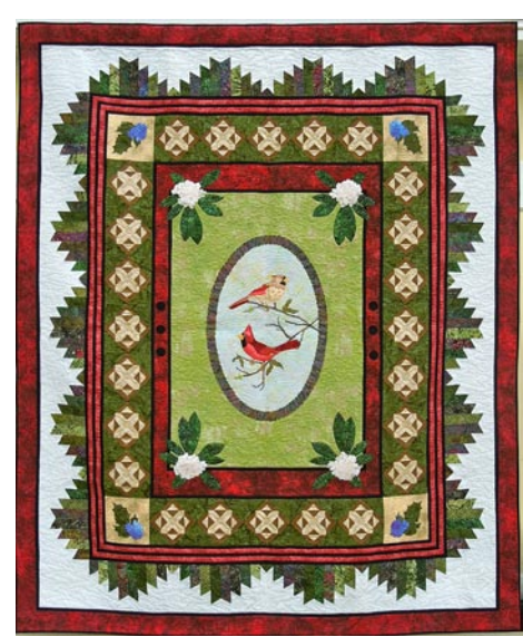
2013 Opportunity Quilt "Our Delectable Mountains" by Out of the Box Bee