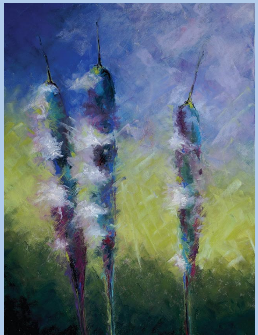
"Wetlands Reflection #6" - Pastel

Join Today & Support Local Art www.wilmingtonart.org