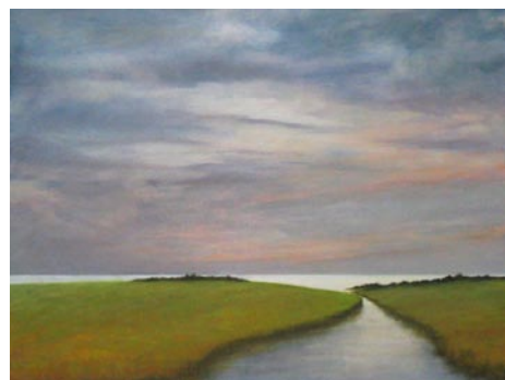
Work by Lolette Guthrie

continued above on next column to the right