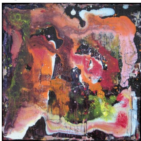
Work by Eduardo Lapetina

Three artists explore the ephemeral magic of light in transforming their creative work. The exhibition is a visual conversation among three unique artists who vary in focal inspiration, creative process, and medium. The result is an exciting, rich visual display. Lolette Guthrie's serene, reflective landscapes contrast with Eduardo Lapetina's vivid, heavily textured abstract paintings. Added to this conversation are the unique mouth-blown glassworks of Pringle Teetor.