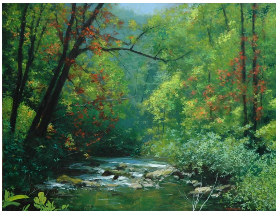
Late Summer on the Chattooga River