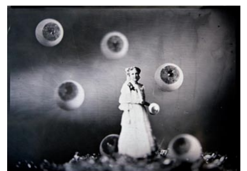
Work by Christine Eadie

Artists included in this exhibition are: