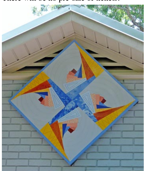
A quilt block on the Upstate Heritage Quilt Trail

The rich heritage of quilting will once again be celebrated throughout Oconee County, SC, during the month of September, with the bi-annual Lake and Mountains Quilt Guild (LMQG) Quilt Show, co-sponsored by the Upstate Heritage Quilt Trail. The show will take place at the Shaver Center in Seneca, SC, and runs from Friday, Sept. 19, 2014, from 9am – 6pm and Saturday, Sept. 20, 2014, from 9am – 5pm. Admission is $5 at the door. There will be no pre-sale of tickets.