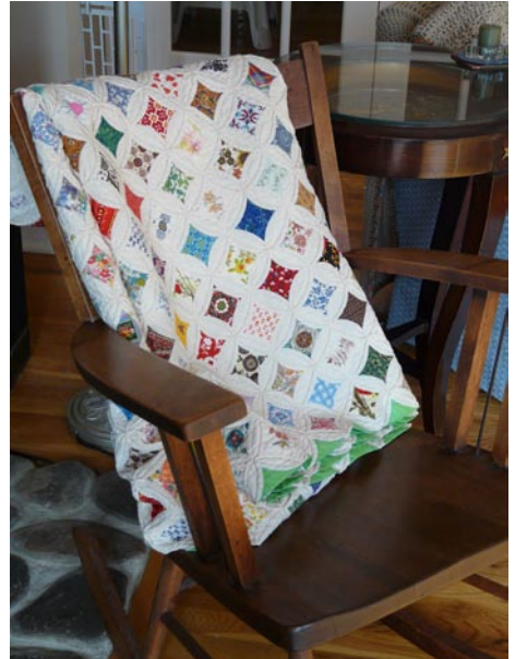
An actual quilt

The LMOG show will feature vendors, boutiques of wondrous items, sales of library items, quilts for sale and a silent auction of other delightful treasures. In addition, quilt appraiser Holly Anderson will be available to do both written and verbal appraisals of quilts in the Seneca area for a fee.