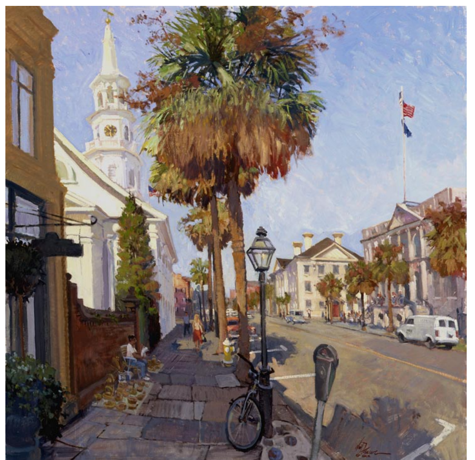
#29 Painting on Broad by West Fraser

The deadline each month to submit articles, photos and ads is the 24th of the month prior to the next issue. This will be Sept. 24th for the October 2016 issue and Oct. 24 for the November 2016 issue. After that, it's too late unless your exhibit runs into the next month. But don't wait for the last minute - send your info now. And where do you send that info? E-mail to ( info@carolinaarts.com ).