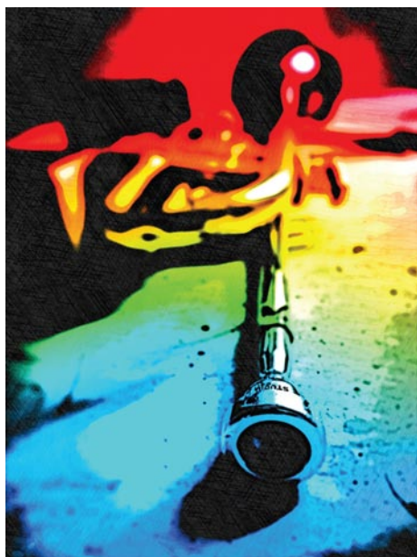
Work by Billy Howe surroundings.

Howe describes Backstage as "a collection of images taken on my iPhone while performing here locally and throughout the southeast. After capturing my ideas, they're transformed with many different software filters and infused with color." Combining his love for music and photography will be a natural fit for Howe's exhibition. Anyone who views his works may decide to pick up their own phones and start capturing their everyday