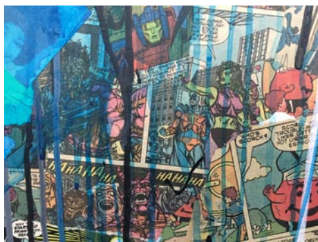
Work by Amiri Farris

For further information check our SC Institutional Gallery listings or visit ( www.701cca.org ).