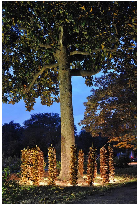
"Southern Magnolia", by Larry Merriman, outside installation shot.

Merriman's installations consist of found/recycled materials, images and texts from his family of four's daily life for more than twenty years. His installation materials range from wood, paper and water to bottle caps, recycled food boxes and bricks. The Cecelia Coker Bell Gallery is located in the Gladys C Fort Art Building on the campus of Coker College in Hartsville. Coker College upholds and defends the intellectual and artistic freedom of its faculty and students as they study and