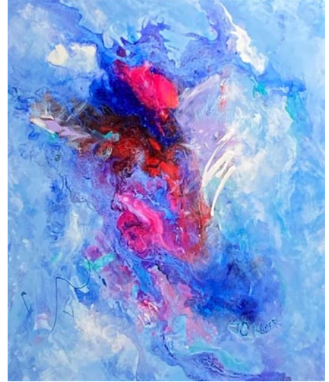
Work by Jane Capraro

SOBA is the heart of the flourishing art hub in Old Town Bluffton's historic district at the corner of Church and Calhoun streets. As a non-profit art organization, SOBA offers regular art classes, featured artist shows, exhibitions, scholarships, outreach programs and more. The gallery is located