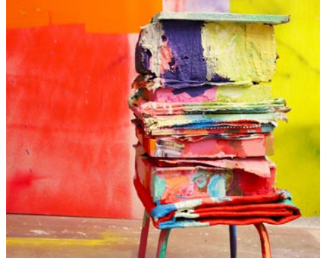
Work by Brittany M. Watkins

For the first time in one space, abstract paintings are placed alongside mixedmedia "remnant works" that blur the lines between painting and sculpture. Handstitched fibers pushed and pulled within the rectangle frame of the traditionally defined, wall-bound painting, continue to evolve. This new series of remnant works use an expanded list of deconstructed domestic