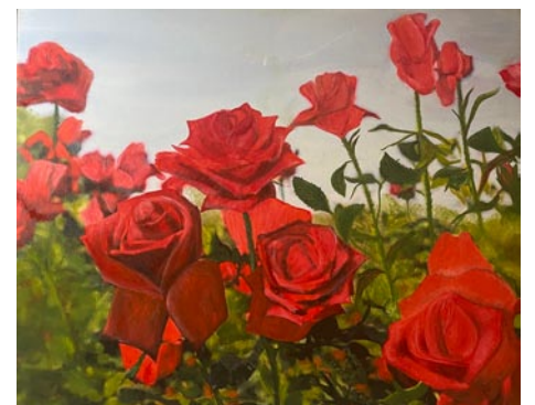
Work by Teda Barrow

Institutional Gallery listings or visit ( artistscollectivespartanburg.org ).