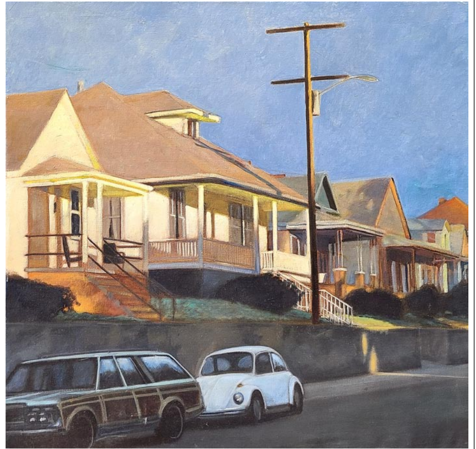
Twilight Street, 1986, Oil, 32 x 33 inches