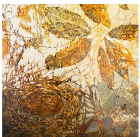
Work by Nancy Smith

Catharine Carter's studio is located at 705 Kensington Drive in Chapel Hill, #61 on the tour map. Carter creates photo-based images which are at once playful, fantastical, and serious, exploring visual stories and