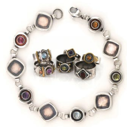
Work by Nell Chandler

Many of the artists on the 2024 tour will have work in the OCAG Preview Exhibit on view at the Hillsborough Gallery of Arts, from Oct. 22 through Nov. 11, 2024. The preview show is a wonderful opportunity for a first look at the work on the tour and can help you plan your tour route.