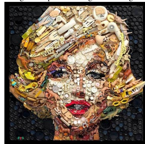
Work by Kirkland Smith

For further information check our SC Commercial Gallery listings or visit ( www.StormwaterStudios.org ).