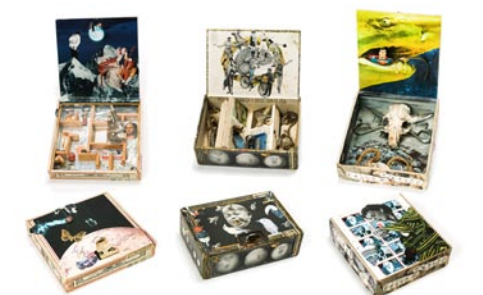
Aldwyth, "Cigar Box Encyclopaedia" 2000

Art League of Hilton Head Academy , 106 Cordillo Parkway on Hilton Head. Through Nov. 8 - "Side-by-Side: BW Photography Re-interpreted into Colorful Works of Art," presented by Lifelong Learning and an Art League art collaboration. This is an exciting exhibit featuring the images of local photographers juxtaposed against the colorful works they inspire. Color photographs are submitted, but local artisans are given black-and-white versions to interpret in their medium. The original color photographs will be unveiled at the exhibit. Hours: Mon.-Fri., 10am-4pm. Contact: call 843/842-5738.